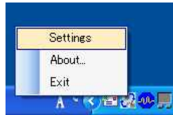
Right Click Menu